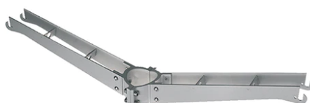
Pole Bracket Franco/Perseo 30 Ø 76 mm 500 mm Double 115.3