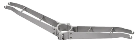
Pole Bracket Minifranco/Perseo 16 Ø 76 mm 500 mm Double 232.6