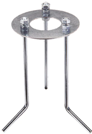
Base Plate and Fixing Bolts Perseo 9 182