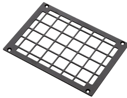
Antivandal Louvre Perseo 16 166.4