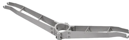
Pole Bracket Minifranco/Perseo 16 Ø 102 mm 500 mm Double 224.6