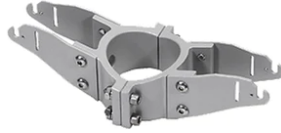
Pole Bracket Minifranco/Perseo 16 Ø 76 mm 180 mm Double 230.6