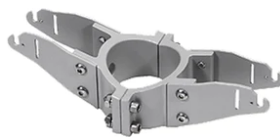
Pole Bracket Minifranco/Perseo 16 Ø 102 mm 180 mm Double 222.6