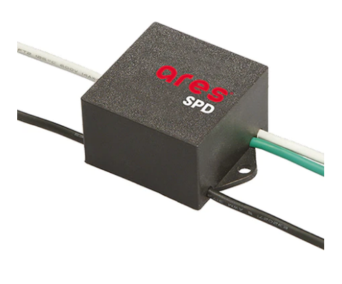
SPD (Surge Protection Device) 237