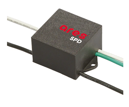
SPD (Surge Protection Device) 237