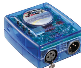
DMX controller; stand-alone/pc interface. F990B11A000