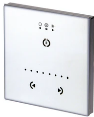
DMX controller; dimmer switch for recessed box (60mm hole centres) F990B10A000