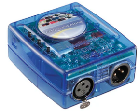
DMX controller; stand-alone/pc interface. F990B11A000