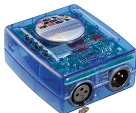
DMX controller; stand-alone/pc interface. F990B11A000