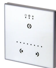
DMX controller; dimmer switch for recessed box (60mm hole centres) F990B10A000