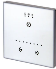
DMX controller; dimmer switch for recessed box (60mm hole centres) F990B10A000