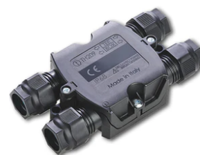
4 way junction box 5 poles IP68 (6-14 mm cables) F990C030000