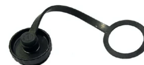
Cap for panel (on the fixtures) plug connector 4-5 poles F021Z070000