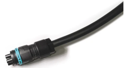
4-pole plug&play connector + 3-pole cable, 5000 mm length. F021Z030000