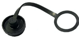
Cap for panel (on the fixtures) plug connector 4-5 poles F021Z070000