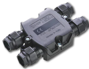
4 way junction box 5 poles IP68 (6-14 mm cables) F990C030000