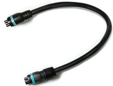
Double 4-pole plug&play connector + 3-pole cable, 600 mm length. F021Z020000