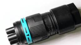
Plug&play connector 4 poles F021Z010000