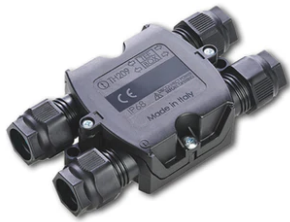
4 way junction box 5 poles IP68 (6-14 mm cables) F990C030000