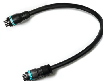
Double 4-pole plug&play connector + 3-pole cable, 600 mm length. F021Z020000