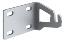
One pair of short brackets L 80 mm. Deep Brown F1203018