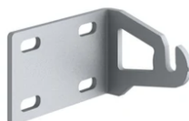
One pair of short brackets L 80 mm. Black F1203030