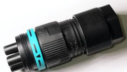
Plug&play connector 5 poles F021Z040000