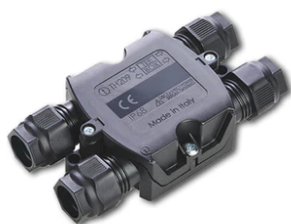
4 way junction box 5 poles IP68 (6-14 mm cables) F990C030000