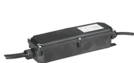
Power supply 24Vdc 70W / 220-240V IP67 Class II selv. Non Dimmable RF25749