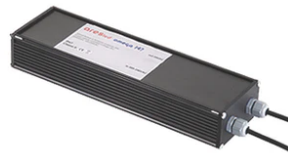
Power supply 24Vdc 50W / 120-240V IP67 Class II selv. Non Dimmable RF25755