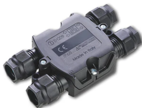
4 way junction box 5 poles IP68 (6-14 mm cables) F990C030000