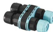
3/4 way terminal block 4 poles IP68 H20 stop. (ø5,5÷12mm cable) F990C010000