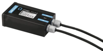
Power supply 48V 60W / 110-240V IP67 Class II selv eq. RF25753