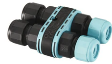
3/4 way terminal block 4 poles IP68 H2O stop. ( \varnothing 5,5+12mm cable) F990C010000