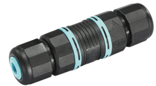
2 way terminal block 4 poles IP68 H2O stop. ( \varnothing 5,5+12mm cable) F990C00A000