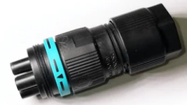
2 way terminal block 4 poles IP68 H2O stop. (ø5,5+12mm cable) F990C00A000