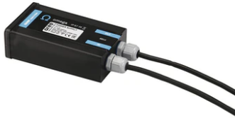
Power supply 48V 60W / 110-240V IP67 Class II selv eq. RF25753