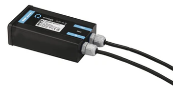
Power supply 48V 60W / 110-240V IP67 Class II selv eq. RF25753