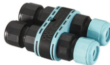
3/4 way terminal block 4 poles IP68 H2O stop. ( \varnothing 5,5+12 mm cable) F990C010000