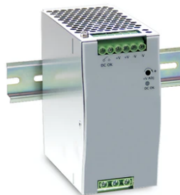
Power supply 48V 240W / 110-240V single output DIN RAIL. RF25746