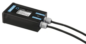
Power supply 48V 60W / 110-240V IP67 Class II selv eq. RF25753