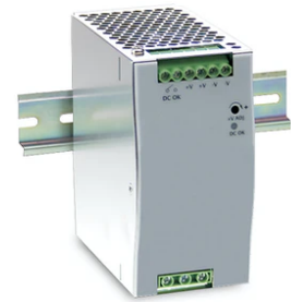
Power supply 48V 240W / 110-240V single output DIN RAIL. RF25746