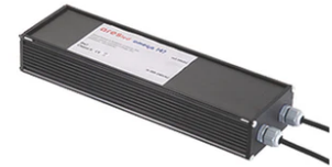
Power supply 24Vdc 50W / 120-240V IP67 Class II selv. Non Dimmable RF25755