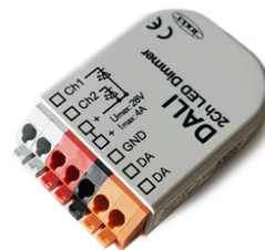
DALI PWM control interface 24Vdc 90W IP20. Power supply not included F990B09A000