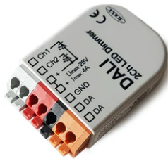
DALI PWM control interface 24Vdc 90W IP20. Power supply not included F990B09A000