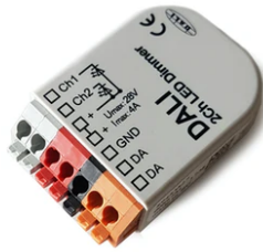
DALI PWM control interface 24Vdc 90W IP20. Power supply not included F990B09A000