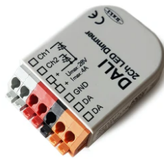
DALI PWM control interface 24Vdc 90W IP20. Power supply not included F990B09A000