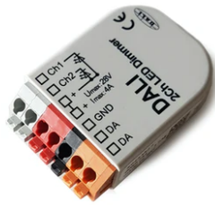
DALI PWM control interface 24Vdc 90W IP20. Power supply not included F990B09A000