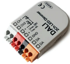
DALI PWM control interface 24Vdc 90W IP20. Power supply not included F990B09A000