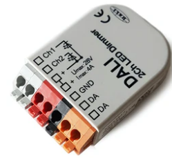
DALI PWM control interface 24Vdc 90W IP20. Power supply not included F990B09A000