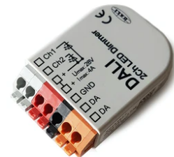
DALI PWM control interface 24Vdc 90W IP20. Power supply not included F990B09A000