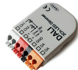
DALI PWM control interface 24Vdc 90W IP20. Power supply not included F990B09A000