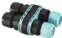
3/4 way terminal block 4 poles IP68 H20 stop. (ø5,5÷12mm cable) F990C010000