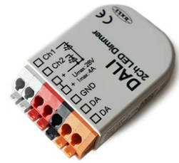
DALI PWM control interface 24Vdc 90W IP20. Power supply not included F990B09A000