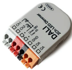
DALI PWM control interface 24Vdc 90W IP20. Power supply not included F990B09A000