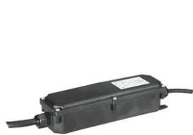
Power supply 24Vdc 70W / 220-240V IP67 Class II selv. Non Dimmable RF25749