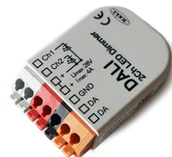
DALI PWM control interface 24Vdc 90W IP20. Power supply not included F990B09A000