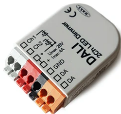
DALI PWM control interface 24Vdc 90W IP20. Power supply not included F990B09A000