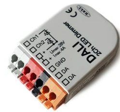
DALI PWM control interface 24Vdc 90W IP20. Power supply not included F990B09A000