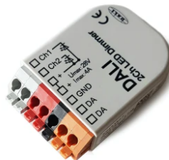
DALI PWM control interface 24Vdc 90W IP20. Power supply not included F990B09A000